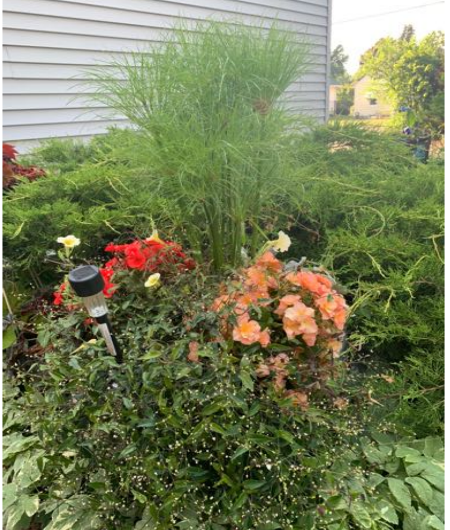
Tahitian Bridal Wreath, Tuberous Begonias and a couple petunias make up container.