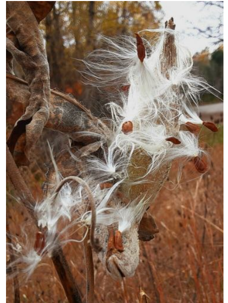
A portent of things to come – fall in all it's glory! Picture source unknown?