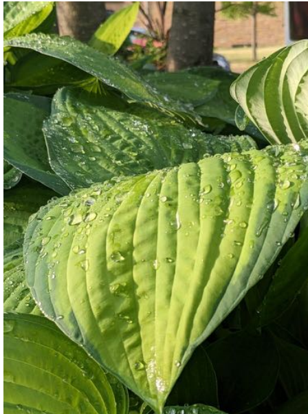
Big leaf, Big raindrops!