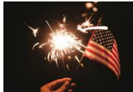
Patriot's Day September 11, 2023