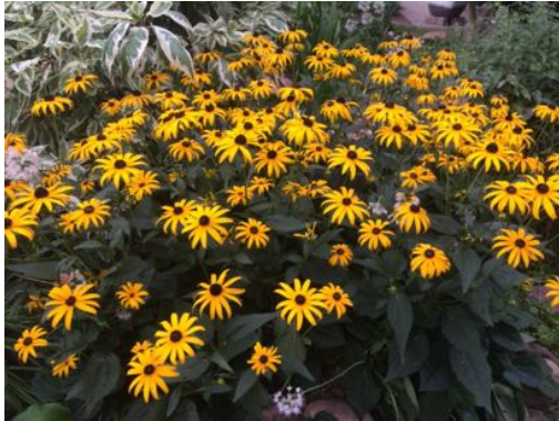
Rudbeckia glows in the garden