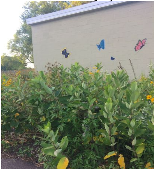
State Fairgrounds butterfly garden