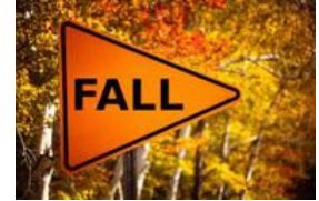
First Day of Fall September 23, 2023

The University of Wisconsin Extension provides affirmative action and equal opportunity in education, programming and employment for all qualified persons regardless of race, color, gender/sex, creed, disability, religion, national origin, ancestry, age, sexual orientation, pregnancy, marital or parental, arrest or conviction record or veteran status." If you need an interpreter, materials in alternate formats or other accommodations to access this program, activity or service, please contact 715-839-4712 as soon as possible preceding the scheduled event so that proper arrangements can be made in a timely fashion